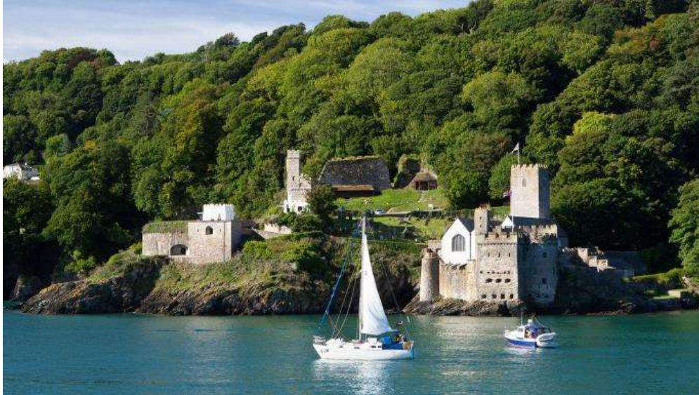
Follow the river to Dartmouth Castle

October 7 2018, 12:01am, The Sunday Times