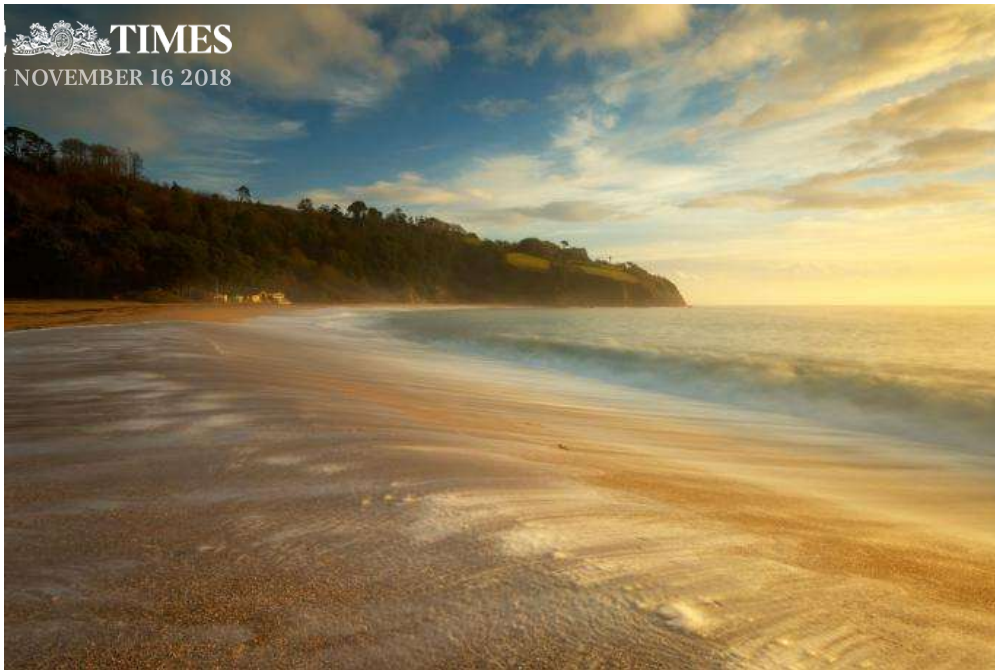
Blackpool Sands

From here, take the easy one-mile river walk or the ferry (Easter to late October; £2.50; dartmouthcastleferry.co.uk ) to 14th-century Dartmouth Castle (£6.80; english-heritage.org.uk ). Kids and Game of Thrones fans will be enthralled by the clockwork woodblock map that you wind to show a 3D version of the castle rising through the decades. On the walk back, poke your head into the crumbling stone walls of Bayard's Cove Fort (free; english-heritage.org.uk ), where the Mayflower stopped for repairs in 1620, en route to America. Alternatively, head the other way along the coast and after four miles you'll hit the seaside delights of Blackpool Sands . The No 3 bus will get you back to town in 15 minutes.