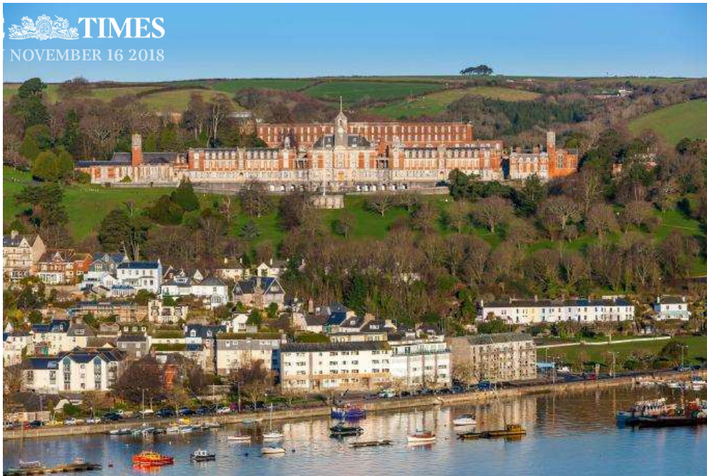
Old school: Britannia Royal Naval College